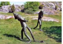
150 Leadenhall Street