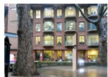
St Helen's Bishopsgate