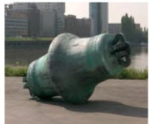
Bishopsgate / London Wall corner