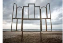
St Boltoph-without-Bishopsgate (key hole)