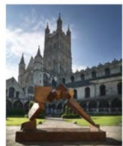
Undershaft - Hiscox